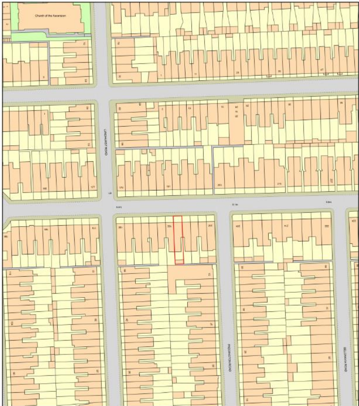
Figure 1 Site Location Plan