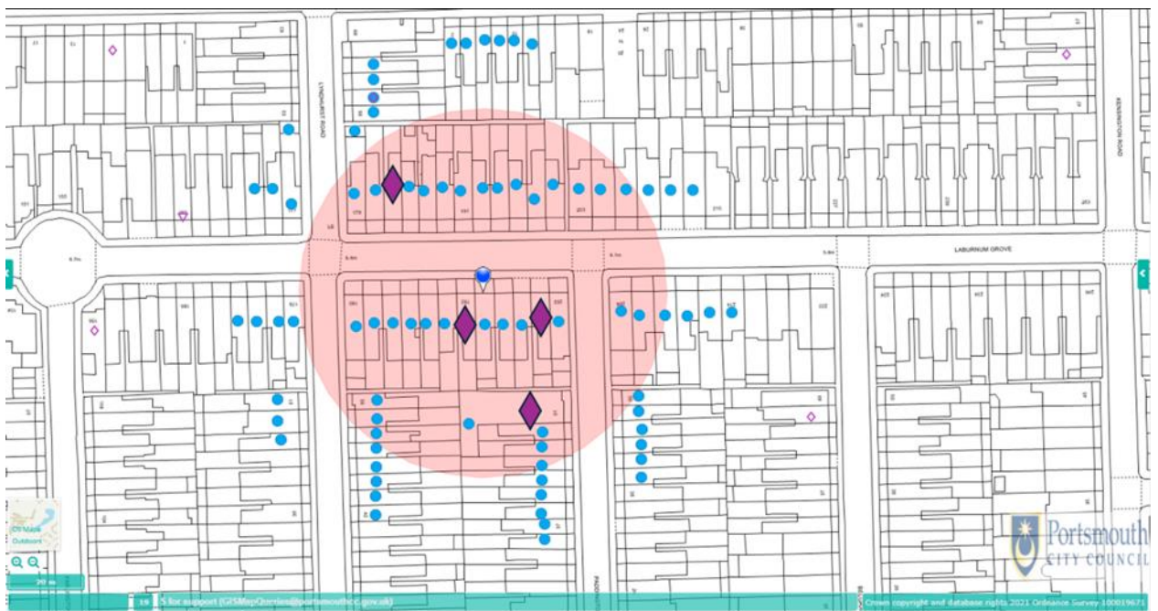
Figure 3 Existing HMOs within 50m of the application site