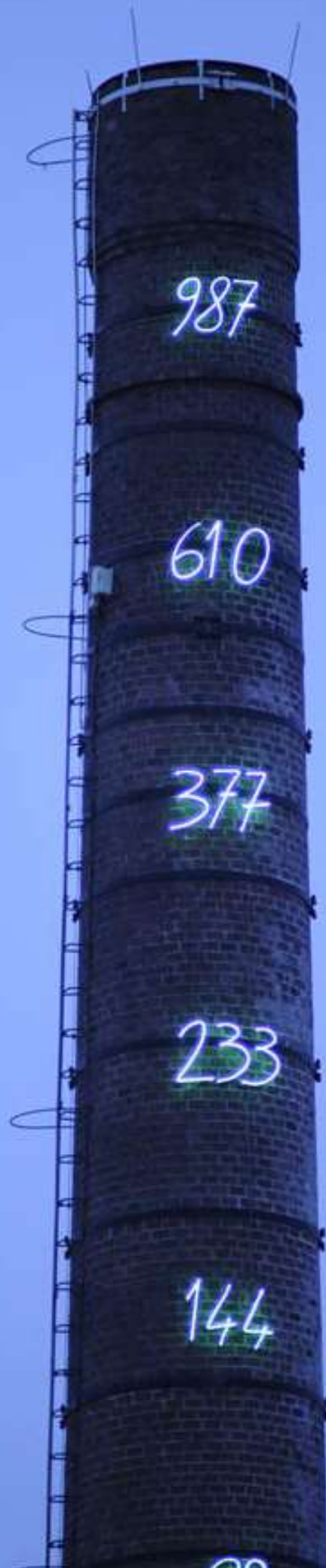
(This page) Mario Merz, Fibonacci-Reihe , 2000 Germany (Opposite) Studio Vertigo, End Over End , 2019 Amsterdam

Portsmouth Creates' We Shine light festival has proven incredibly popular with audiences from across the city. We intend to launch the light installation at Southsea Castle Lighthouse as part of We Shine 2024. While We Shine lasts for one weekend, we intend for the installation at Southsea Castle to have a lifespan of at least two years.