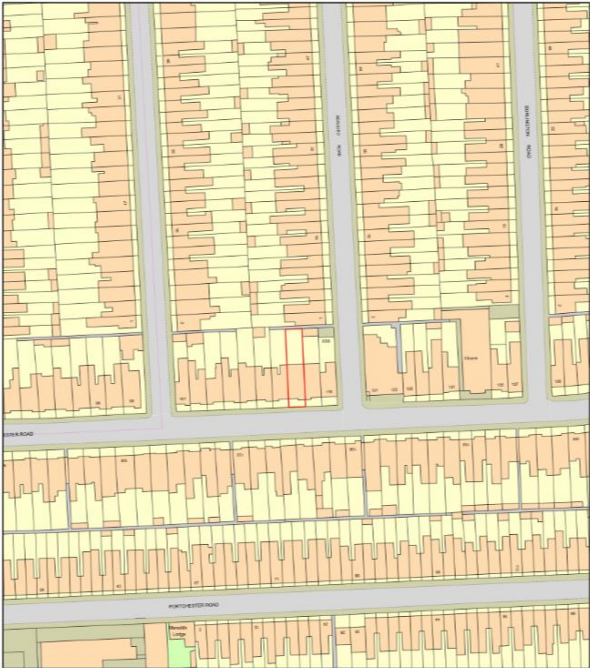
Figure 1 Location plan