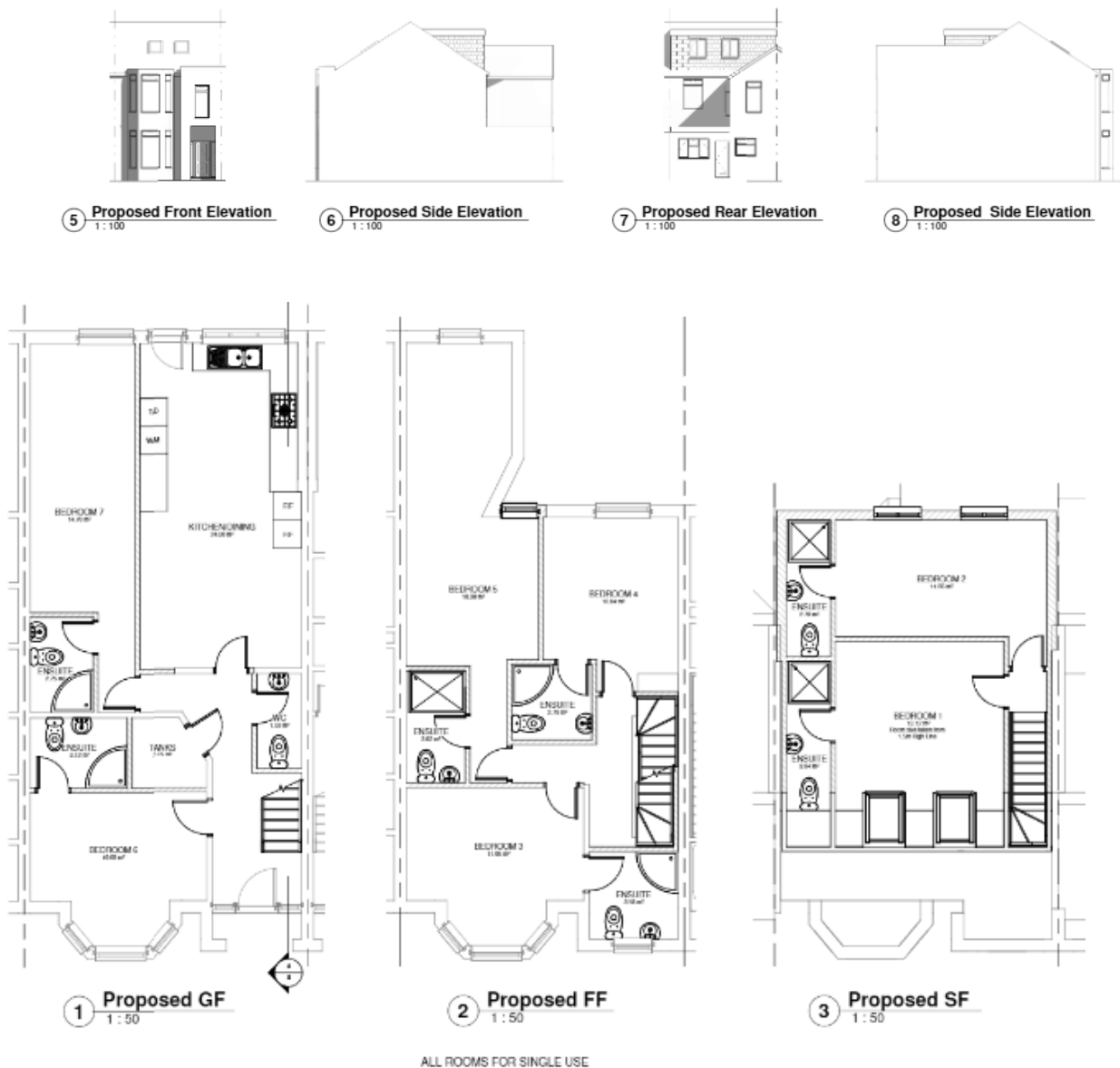
Figure 2 Proposed Floor Plans & Elevations

3.3 The Applicant has stated that works to extend the property will be undertaken under permitted development (without the need to apply for planning permission). These works include a rear dormer and rooflights to the front roofslope; these works are not included in the application. They should not be considered as part of the application.