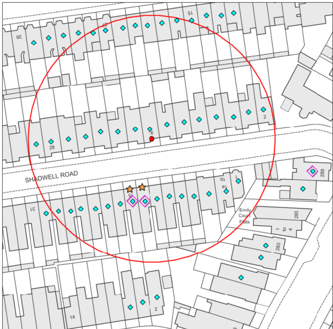
Figure 2 Existing HMOs within 50m of the application site