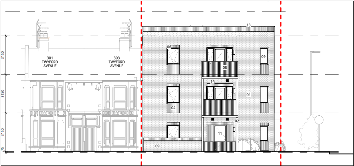
Figure 4 East Elevation