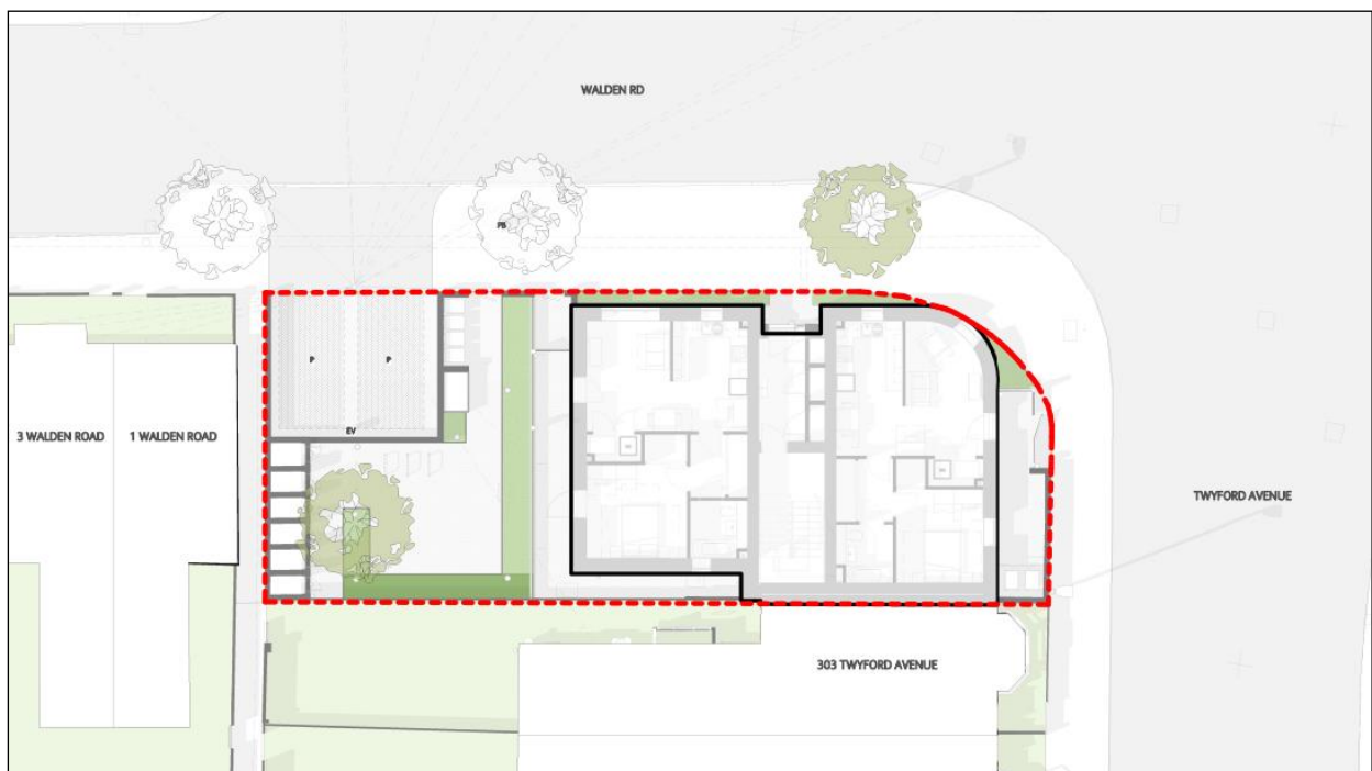
Figure 1 Proposed Site Plan