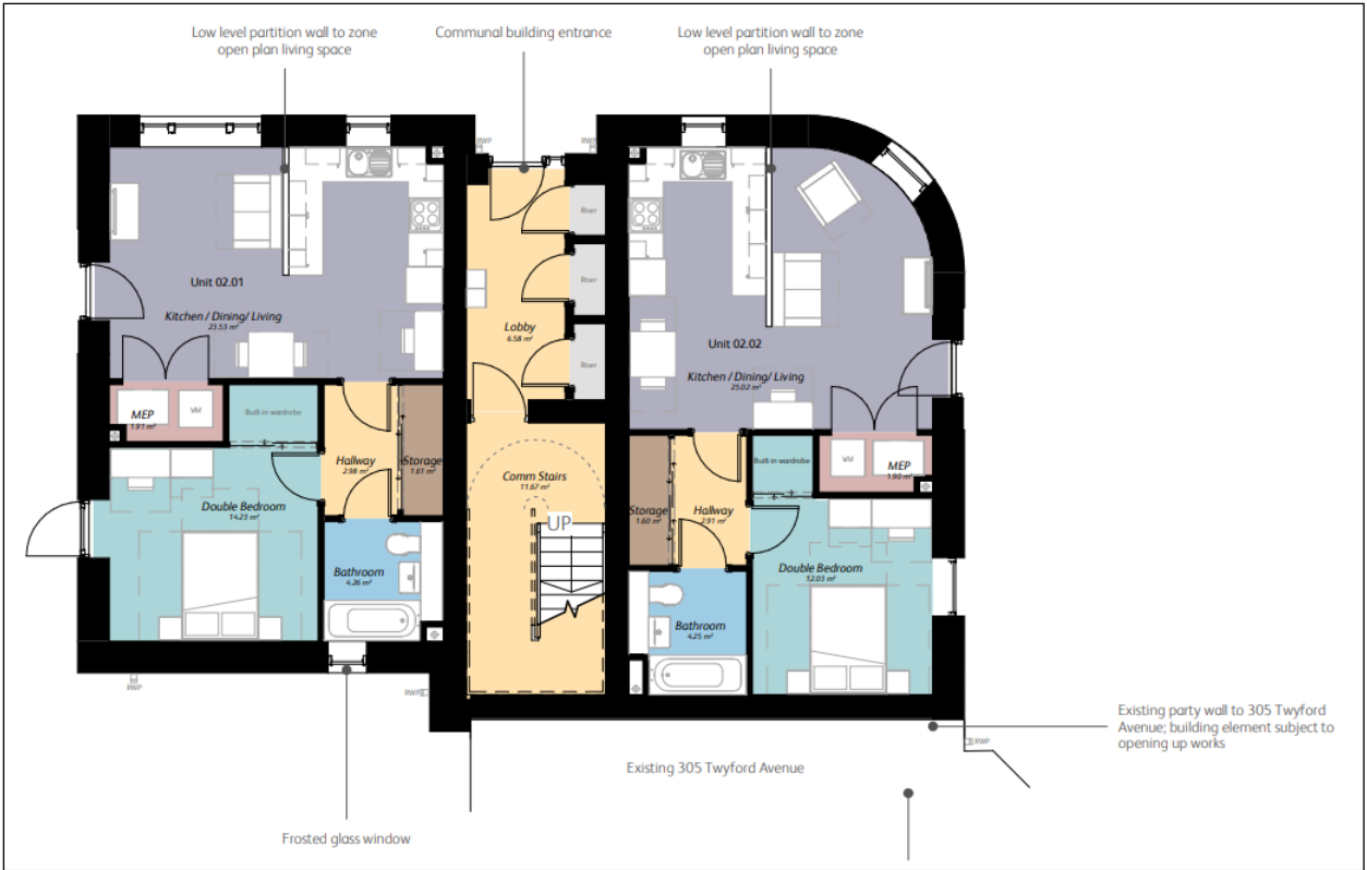
Figure 2 Ground Floor Plan