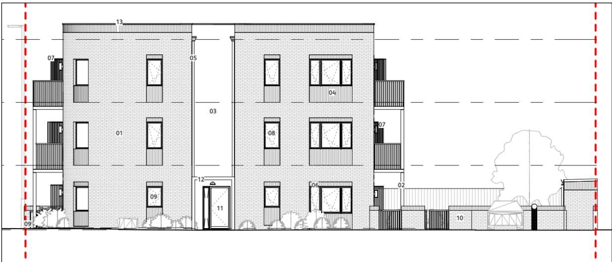
Figure 3 Proposed North Elevation