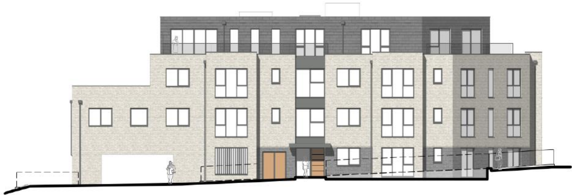
East Elevation Scale 1: 200 @ A3