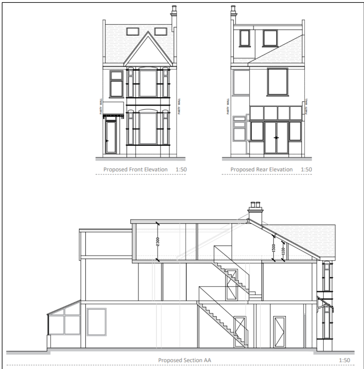
Figures 2 and 3 - Proposed Elevations and Plans