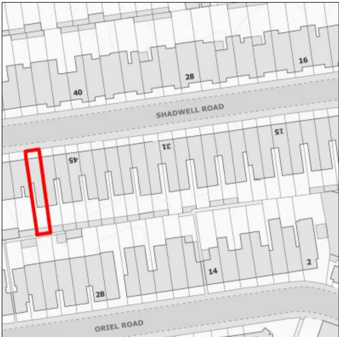
Figure 1 - Site Location Plan