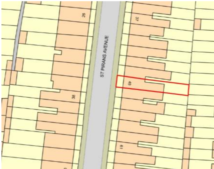
Figure 1 - Site Location Plan