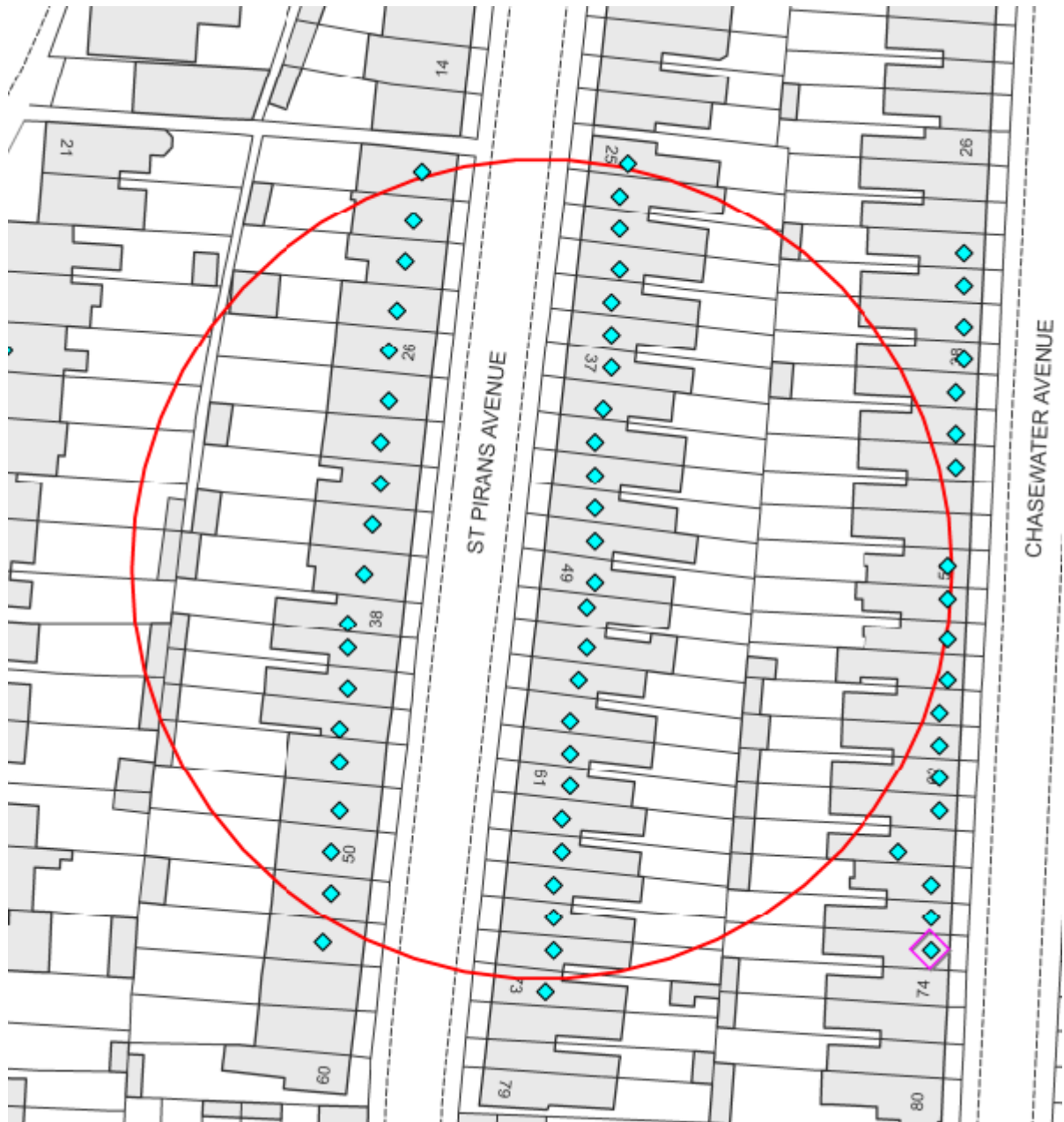
Figure 4 - Existing HMOs within 50m of the application site