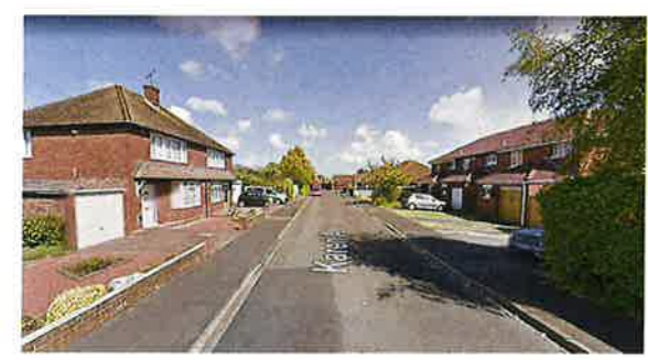
01 Looking East along Karen Avenue