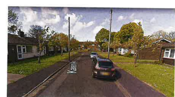
03 Looking North along Karen Avenue