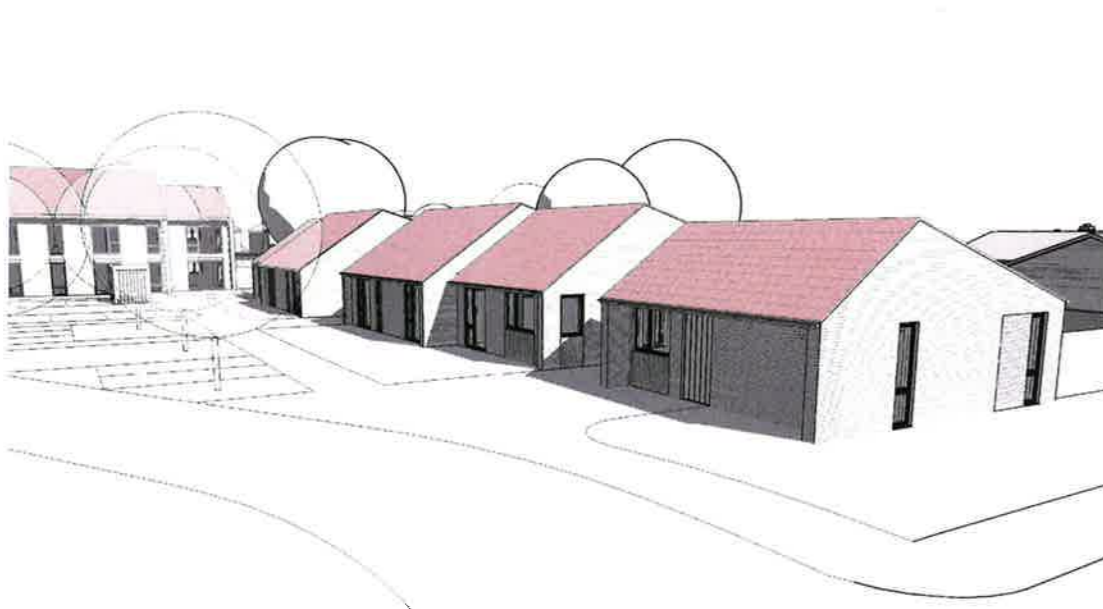
View from Karen Avenue | Looking North