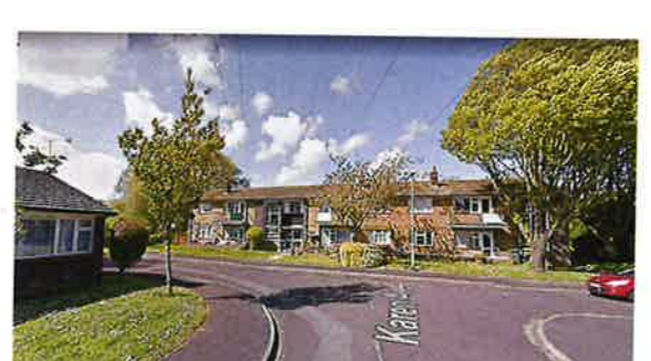
04 Continuing North along Karen Avenue