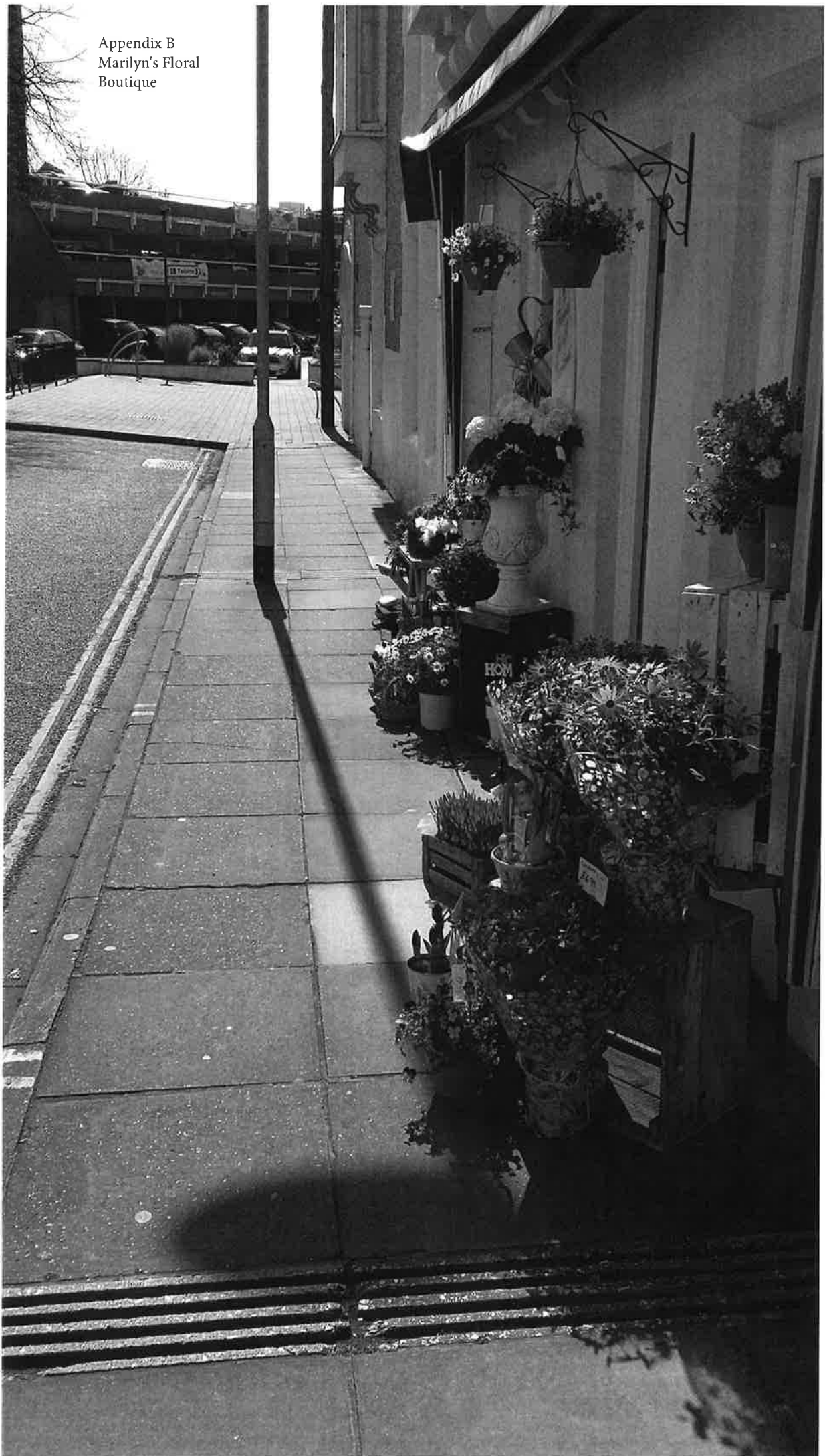
Appendix B Marilyn's Floral Boutique